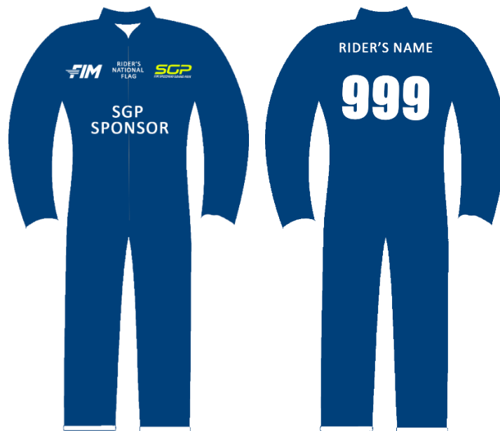
DIAGRAM 1 - RACE SUIT See art. 5.8