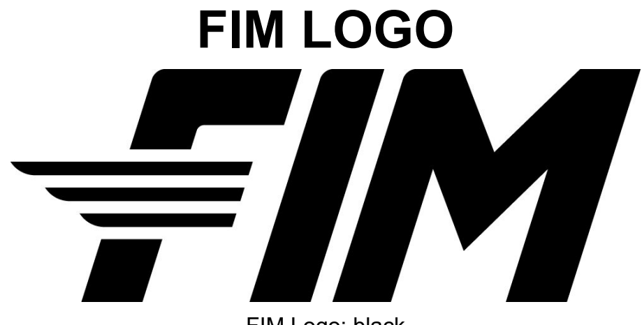
FIM Logo: black