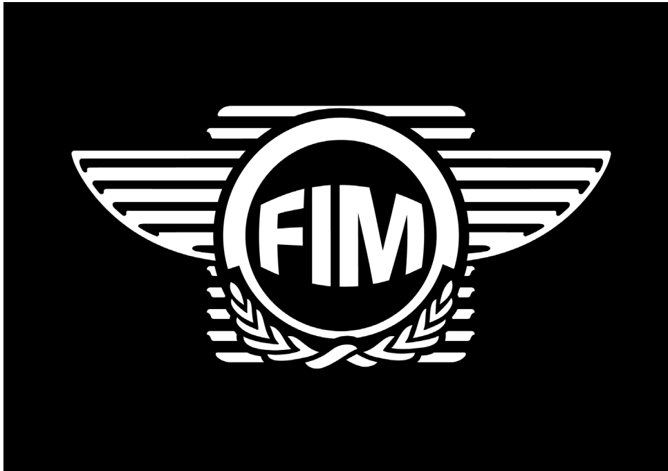
FIM Logo: white