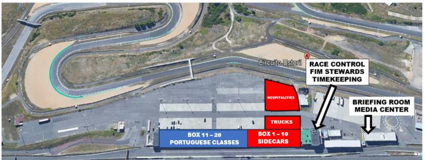
Pit building & Paddock plan