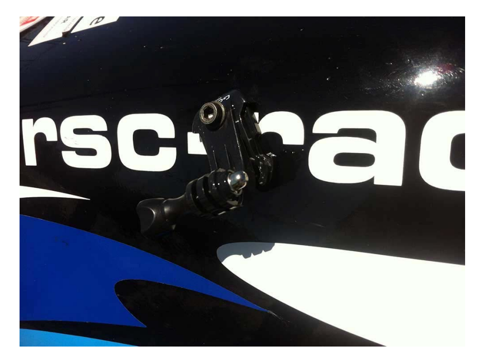
Support ready for the race