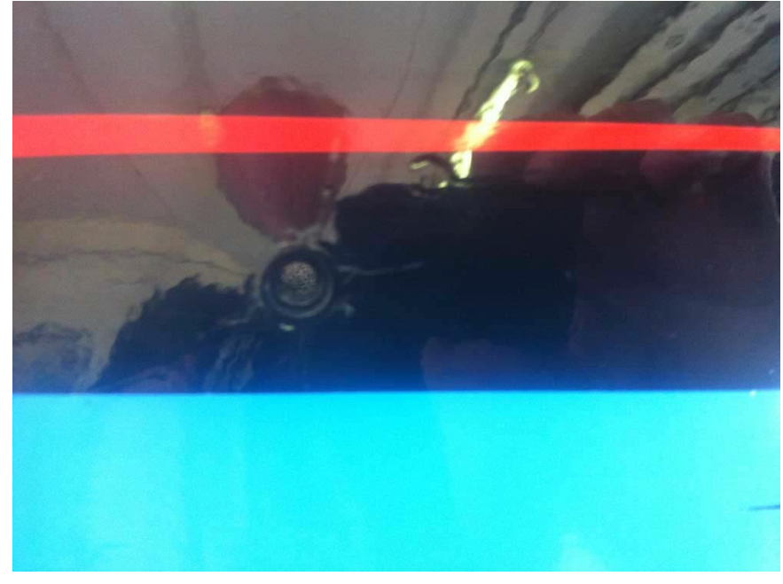
Hole in the fairing