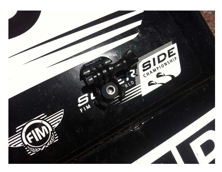
Remaining support on the fairing between races