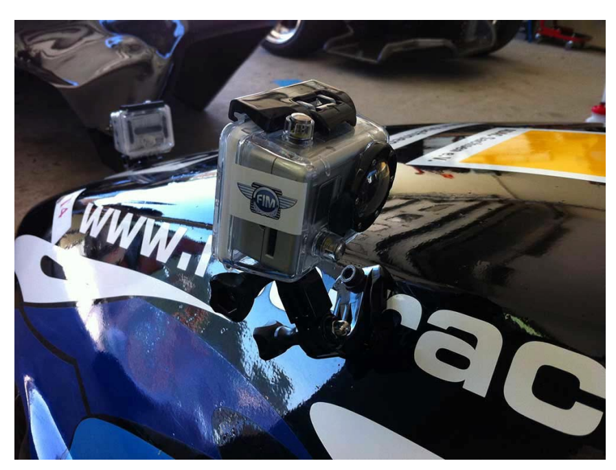
First framing check