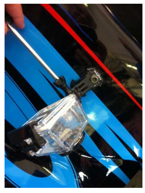
Adjusting the support