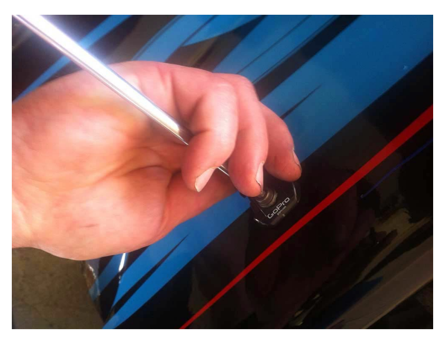
Fixing of support in the fairing