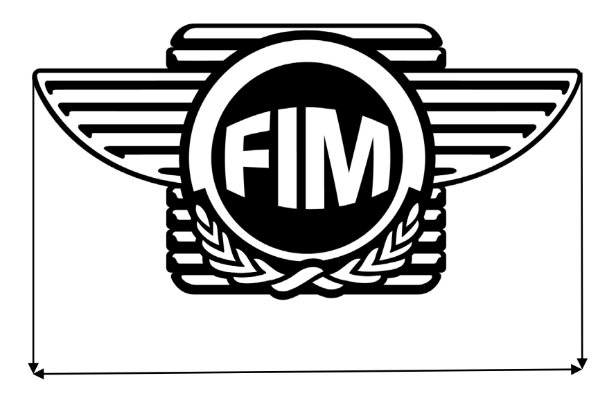
Width: 6.5 cm FIM Logo: black