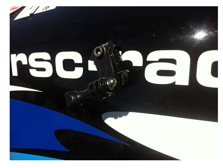
Support ready for the race