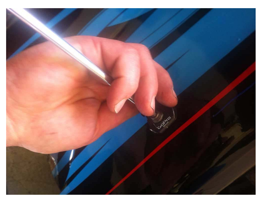
Fixing of support in the fairing