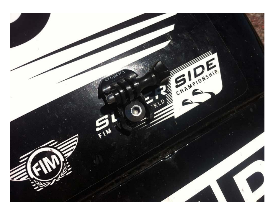
Remaining support on the fairing between races