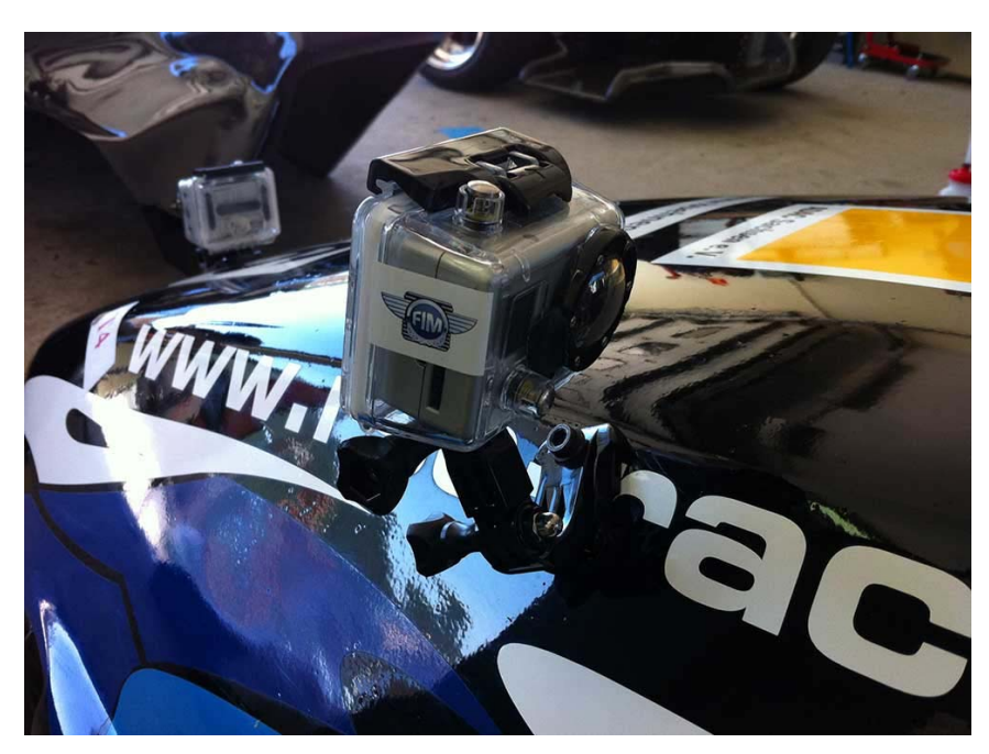
First framing check