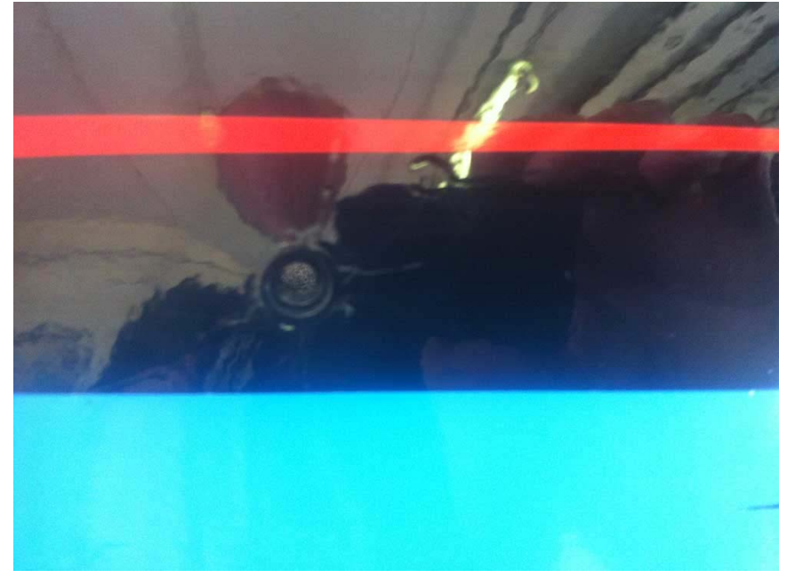
Hole in the fairing