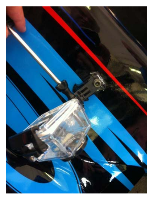
Adjusting the support